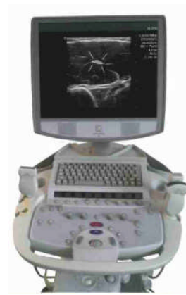
Emergency Department Targeted Ultrasound (EDTU)

Enhancing patient care at the Devon General Hospital all proceeds from the 2009 Turkey Chase will be used for the purchase of an Emergency department targeted ultrasound (EDTU). EDTU's are a proven aid in the evaluation and treatment of emergency patients. Immediate access to bedside EDTU enhances patient care and safety by expediting the management of critical illness and by avoiding transfer of potentially unstable patients outside the emergency department for diagnostic testing.